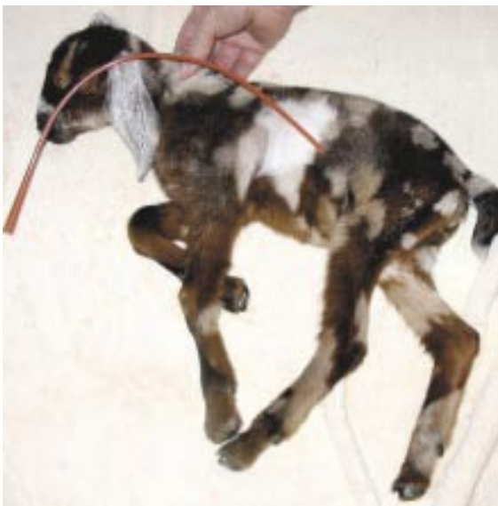
Positioning the tube for marking.