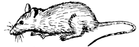
Figure 3. Mus musculus House Mouse

Diagrams of Rodents from Oklahoma State University Extension