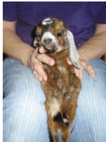
Holding a kid for tubing.